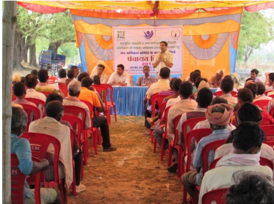
Figure 1 - Panchayat shivir held at West Singhbhum

ELDF, with the support and cooperation of the Department of Welfare, Jharkhand engaged in a program to facilitate the implementation of Scheduled Tribes and Other Traditional Forest Dwellers (Recognition of Forest Rights) Act 2006 (FRA) in the state of Jharkhand. The Foundation lent its support to the Firm in undertaking this significant program as its research and analysis arm.